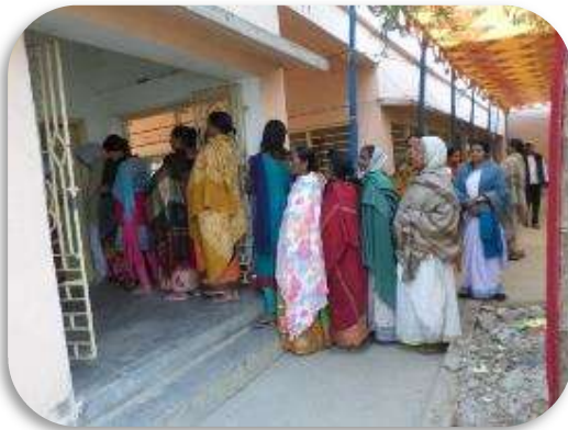
Checkup of Gynecologist Who oil chair distribution from SPSRISTEE